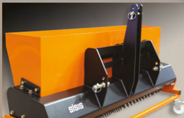
Standard cat 1, 3 point linkage for easy fitting to any tractor