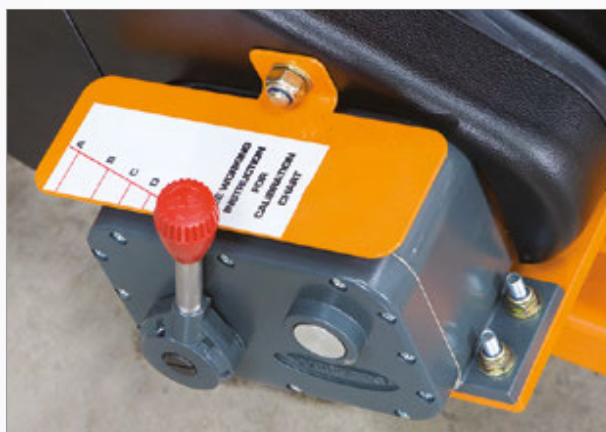
Zero Max Box for variable seed rates