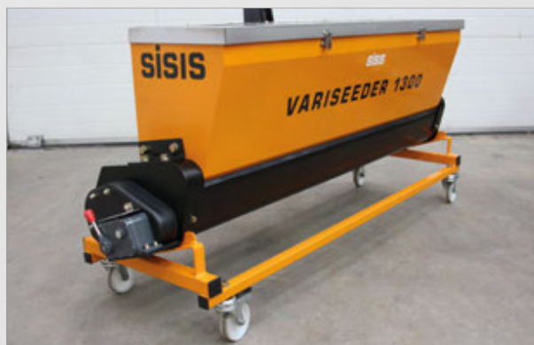
Transport trolley – storage trolley for ease of movement in the shed/workshop