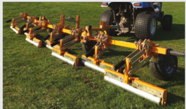
Attached and ready for action