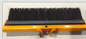
Optional brush head