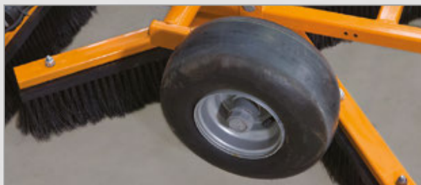
Adjustable wheels (Varibrush)