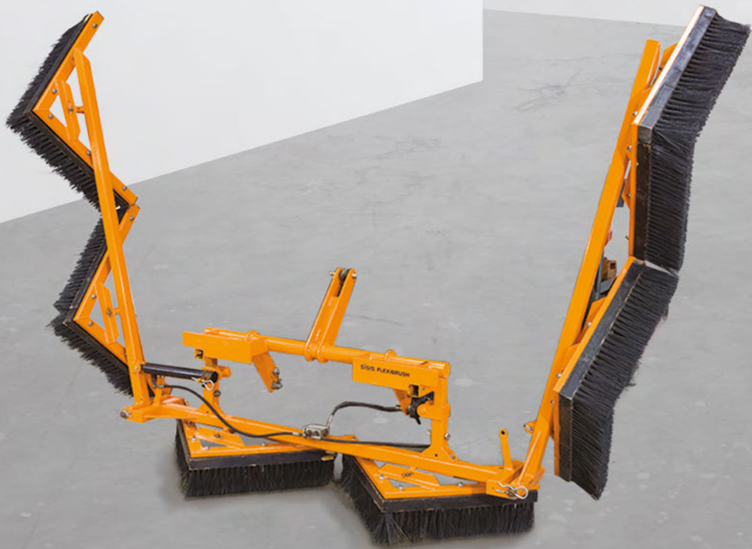
Image shows Flexibrush

Football, Hockey, Rugby | Cricket | Golf | Local Authority & Contractors