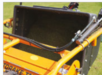
Large capacity collection box, shown with optional hydraulic tip kit