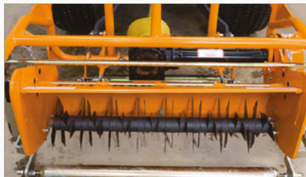
Contra rotating reel ensuring excellent performance