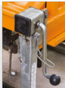
Quick, single lever tine depth setting for easy adjustment

The Aer-Aid system injects air directly into the root zone speeding up the aeration process, moving air uniformly throughout the root zone for complete aeration – not just where the tines have penetrated.