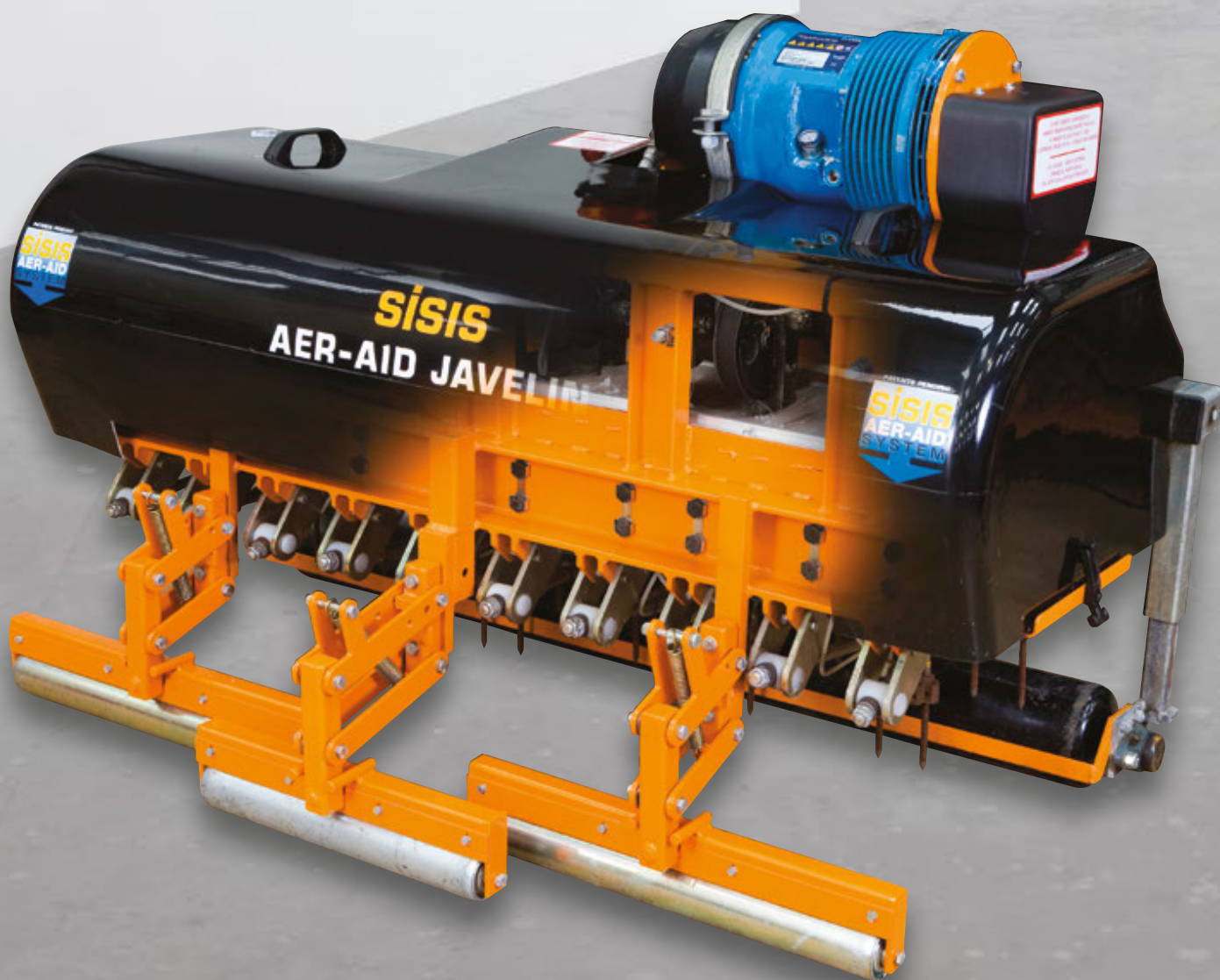
Image shows Javelin Aer-Aid complete with rear roller

Football, Hockey, Rugby | Cricket | Golf | Local Authority & Contractors