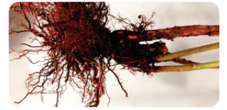
Crown and Root Rot