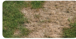
Seedling Damping Off