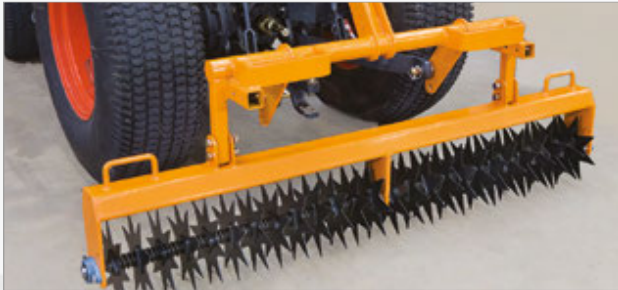
Singleplay frame suitable for 1 implement

Single pass maintenance system which accepts a variety of implements for use on both turf and hard porous surfaces. Up to four operations can be carried out simultaneously with this simple and versatile system.