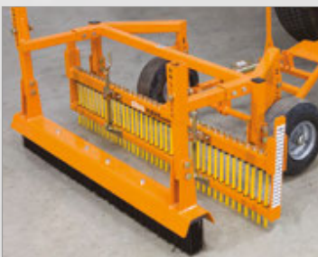
Towed implement frame with extension arms suitable for 2 implements

Ideal for towing behind small compact tractors when hydraulic lift is not available. The system can use implements singly or in pairs by using the optional extension arms.