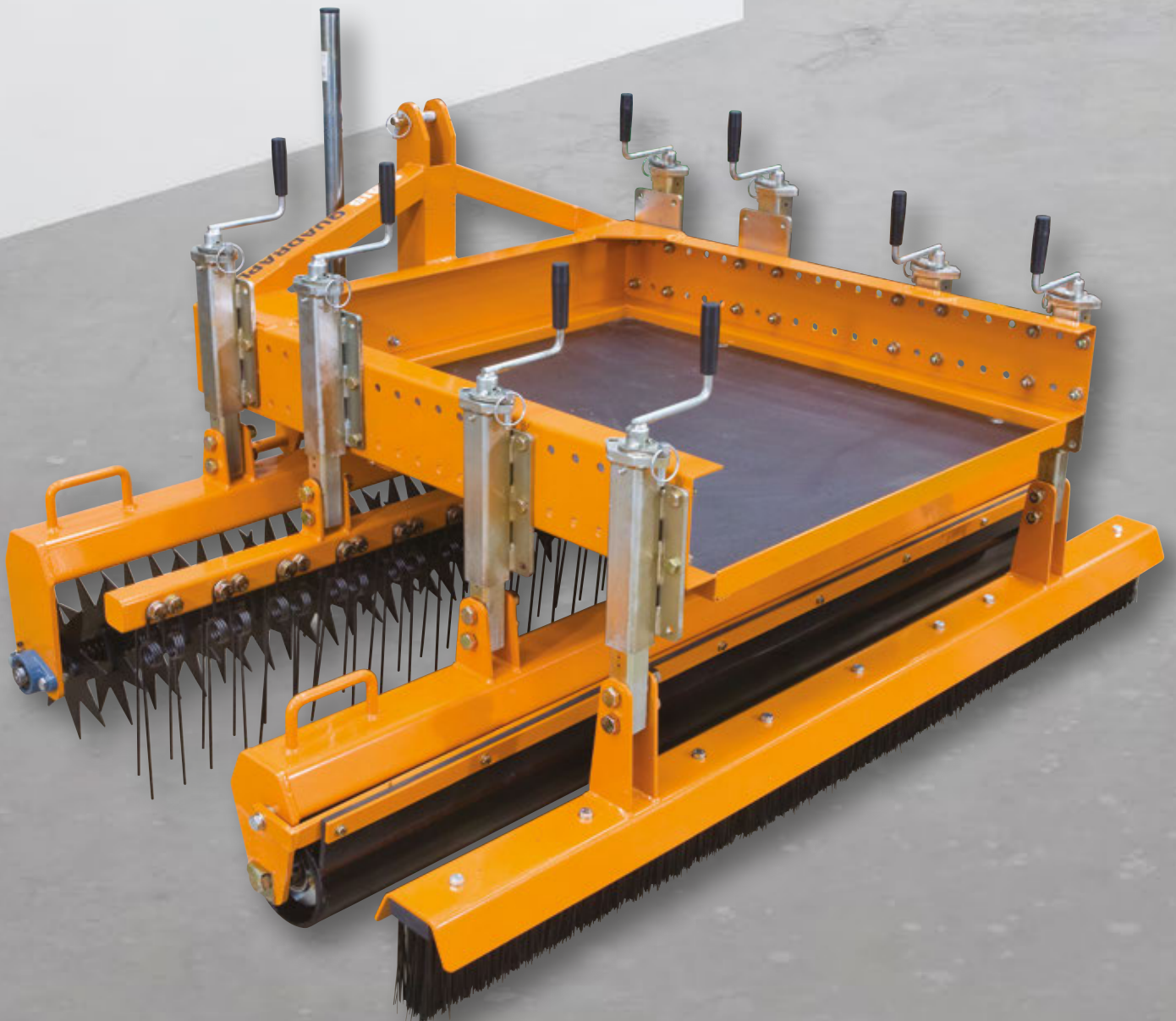
Image shows Quadraplay frame with four implements

Football, Hockey, Rugby | Cricket | Golf | Local Authority & Contractors