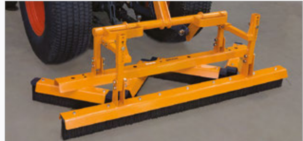
Twinplay frame suitable for 2 implements

Connects to any tractor with 3 point linkage and utility trucks with suitable frame.